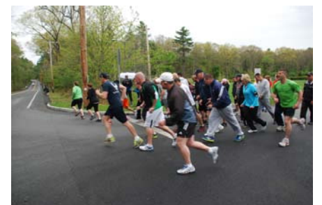
Runners take off at the start line during the Wellness Walk/Run

Although Tuesday, May 8, 2012, was a cold, breezy and lightly rainy day, it did not stop over 400 staff throughout the Department of Correction from participating in the Health and Wellness Walk and Fun Run.