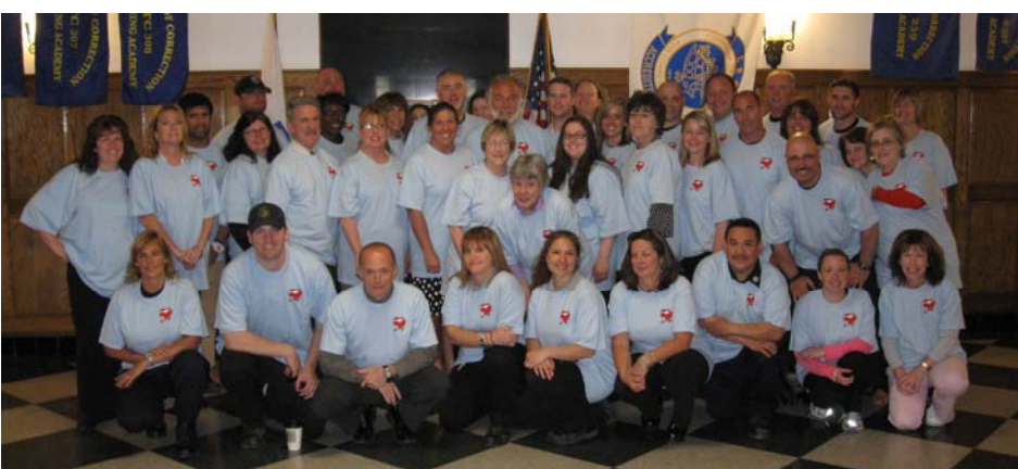
MCI Norfolk "Walking Challenge" participants

So if you're at MCI Norfolk this summer, take a look around. Things might look a little different.