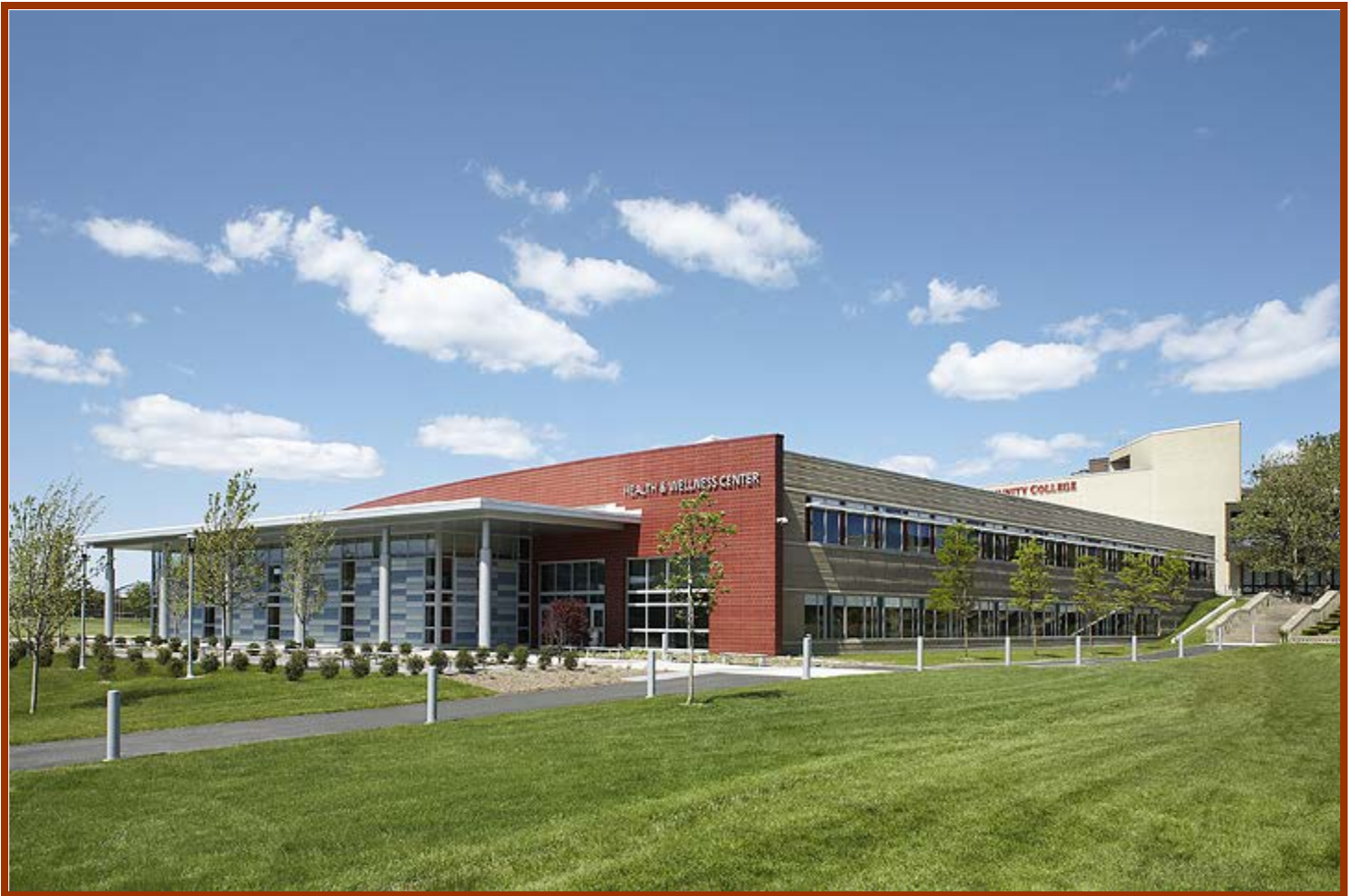
Bunker Hill Community College Health & Wellness Center

Executive Office for Administration and Finance