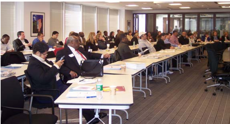
Attendees learn about doing business with the state from contract directors and M/WBEs who have state contracts at the recent AMP "Contracting with State Entities" workshop in Boston.

Over 50 M/WBE's attended the recent AMP Advanced Vendor RFR Workshop "Contracting with State Entities" held at 1 Beacon Street in Boston on January 18. Attendees learned how to navigate the state's online solicitation system, how to market to the state and how to succeed in the bidding process from contract directors including M/WBE's, who have already done it. Feedback about the training was overwhelmingly positive, as indicated by the 90% approval rating given by surveyed attendees.