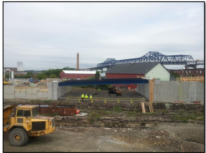
Water Street Connector Span 1 structural steel installed

As part of the D/B process, the team's lead designer, VHB, and its consultants are advancing the design for future stages of the project. An update public information meeting is planned for late fall 2014. Sign up on the website to receive email advisories and notices.