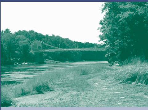
South-Side Access and Chain Bridge

There are about twenty unpaved, public parking spaces located up near the roadway. Boat access is several hundred yards from the parking area through the woods and saltmarsh. There are several areas to access the river. Depending on the height of the tide at any given time some areas are more desirable than others.