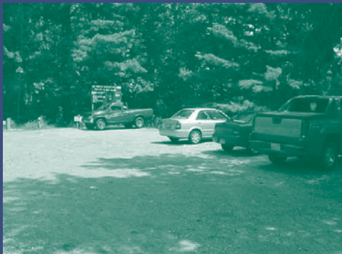
Deer Island Parking Area

The Deer Island kayaker access is located at the downstream end of Deer Island in the Amesbury conservation property. The island is located off of Main Street in the Merrimack River adjacent to the Chain Bridge.