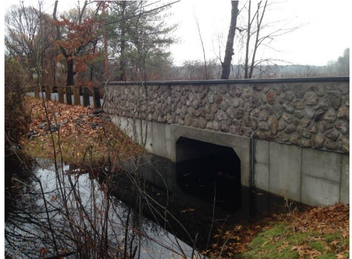
Spencer Brook Culvert in Concord (After)

Westford, MA – A second project, pictured below, was completed this fall in the Town of Westford. The project is intended to mitigate flood damage to the Route 40 (Groton Rd.) roadway structure and to lower flooding conditions around nearby Keyes Pond. This road is a vital component of the regional transportation system as well as regional commerce. The town replaced an existing undersized stone arch (and 60" corrugated metal pipe) culvert with a 12' span x 3.5' clear height precast concrete bridge system with headwalls/wing walls, and natural gravel bottom. The total cost for this project was $522,000.