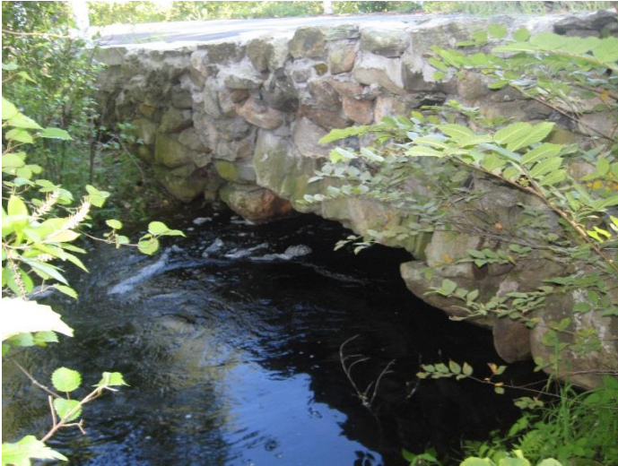
Spencer Brook Culvert in Concord (Before)

Concord, MA – The fall 2016 construction season was busy for communities around the Commonwealth working on Hazard Mitigation Grant funded projects. One example, pictured below, is the new Spencer Brook culvert in Concord at Westford Road, which has repeatedly experienced localized flooding and roadway overtopping during storm events. The town replaced an existing undersized field stone culvert with a 7' wide x 5.25' high concrete culvert, with stone fascia, bluestone headwall caps and natural gravel bottom. This upgrade will protect the roadway from heavy flows of floodwater surcharging down Spencer Brook. The total cost for the project was $179,000.