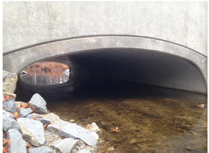
Groton Road Culvert in Westford (After)

To learn more about MEMA's Hazard Mitigation Program, visit: http://www.mass.gov/eopss/agencies/mema/resources/mitigation/