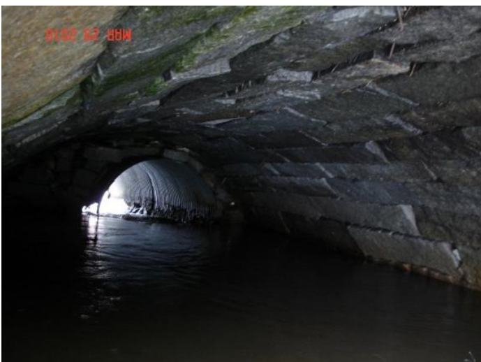
Groton Road Culvert in Westford (Before)

Westford, MA – A second project, pictured below, was completed this fall in the Town of Westford. The project is intended to mitigate flood damage to the Route 40 (Groton Rd.) roadway structure and to lower flooding conditions around nearby Keyes Pond. This road is a vital component of the regional transportation system as well as regional commerce. The town replaced an existing undersized stone arch (and 60" corrugated metal pipe) culvert with a 12' span x 3.5' clear height precast concrete bridge system with headwalls/wing walls, and natural gravel bottom. The total cost for this project was $522,000.