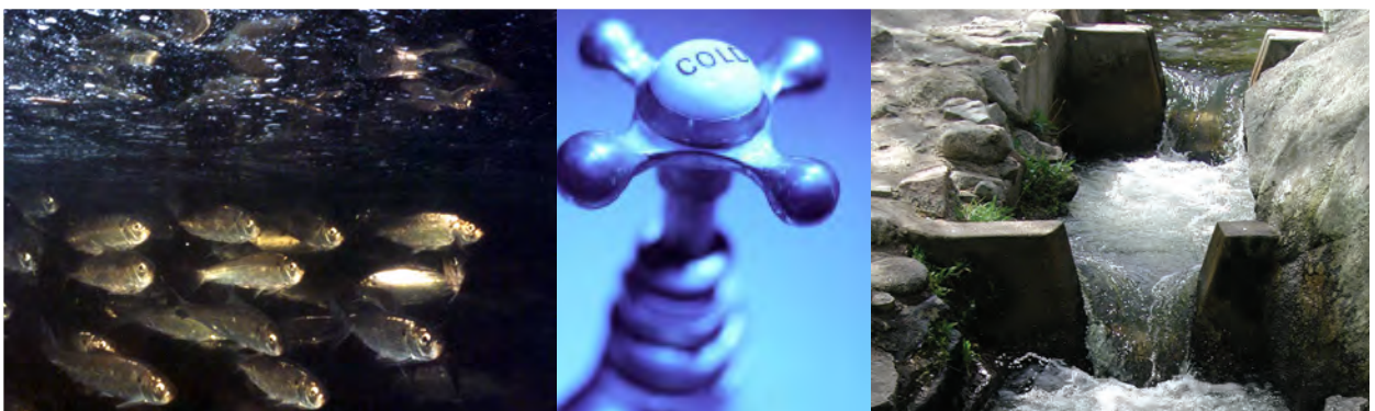
New Water Management Act regulations utilize a transparent, predictable and science-based approach that provides water for both economic development and environmental sustainability.

For more information on the Water Management Act program including the new regulations, go to: http://www.mass.gov/eea/agencies/massdep/water/watersheds/water-management-act-program.html