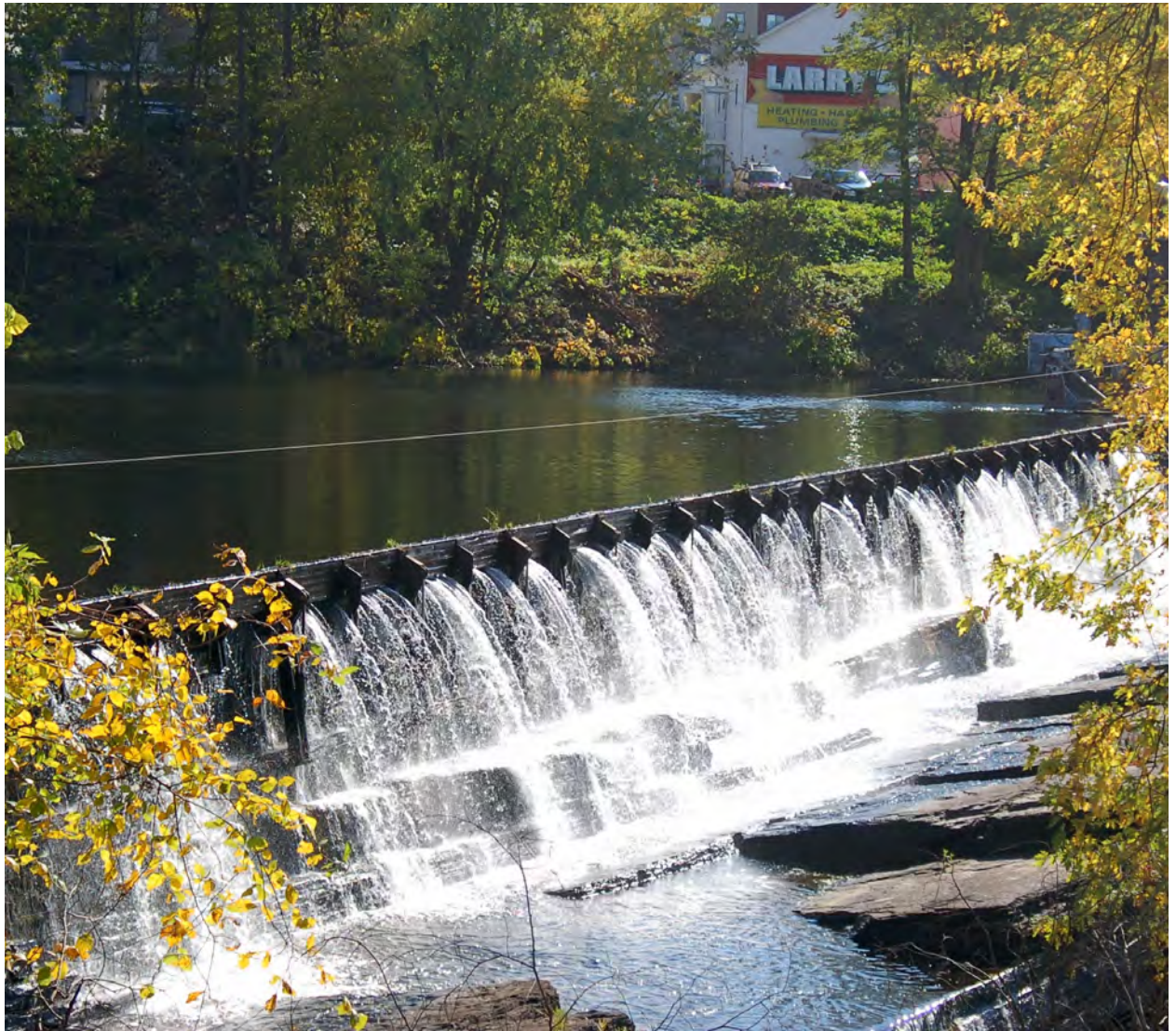
Photo of Chicopee Falls

mills at Chicopee Falls is one of the largest and most complex Brownfield cleanup and redevelopment projects in New England. He further stated that the team that worked on this project has raised the bar for cooperation at all levels of government to achieve success. The award received by the team recognized their accomplishment as one of the most noteworthy among peers nationwide.