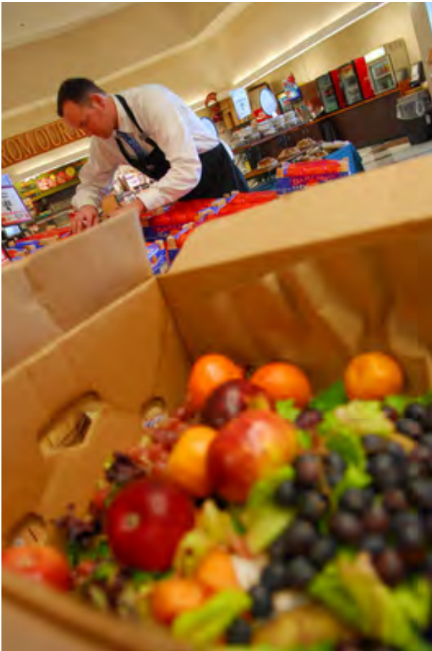
Culling food at a supermarket.

October 1, 2014, marked the official start of the Commonwealth's first-in-the-nation ban on the disposal of commercial organic wastes by businesses that dispose of one ton or more of organics per week. The disposal ban affects approximately 1,700 businesses and institutions, including supermarkets, colleges and universities, hotels, convention centers, hospitals and nursing homes, large restaurants, and food service and processing companies. It does not affect residences. This ban will divert 450,000 tons of food waste a year from landfills and incinerators and direct it to composting facilities or anaerobic digesters which produce renewable fuel from the material. This initiative will reduce waste; cut disposal costs for businesses and institutions; reduce emissions from fossil fuel use; re-purpose food for food banks and fertilizer; and stimulate the green economy.