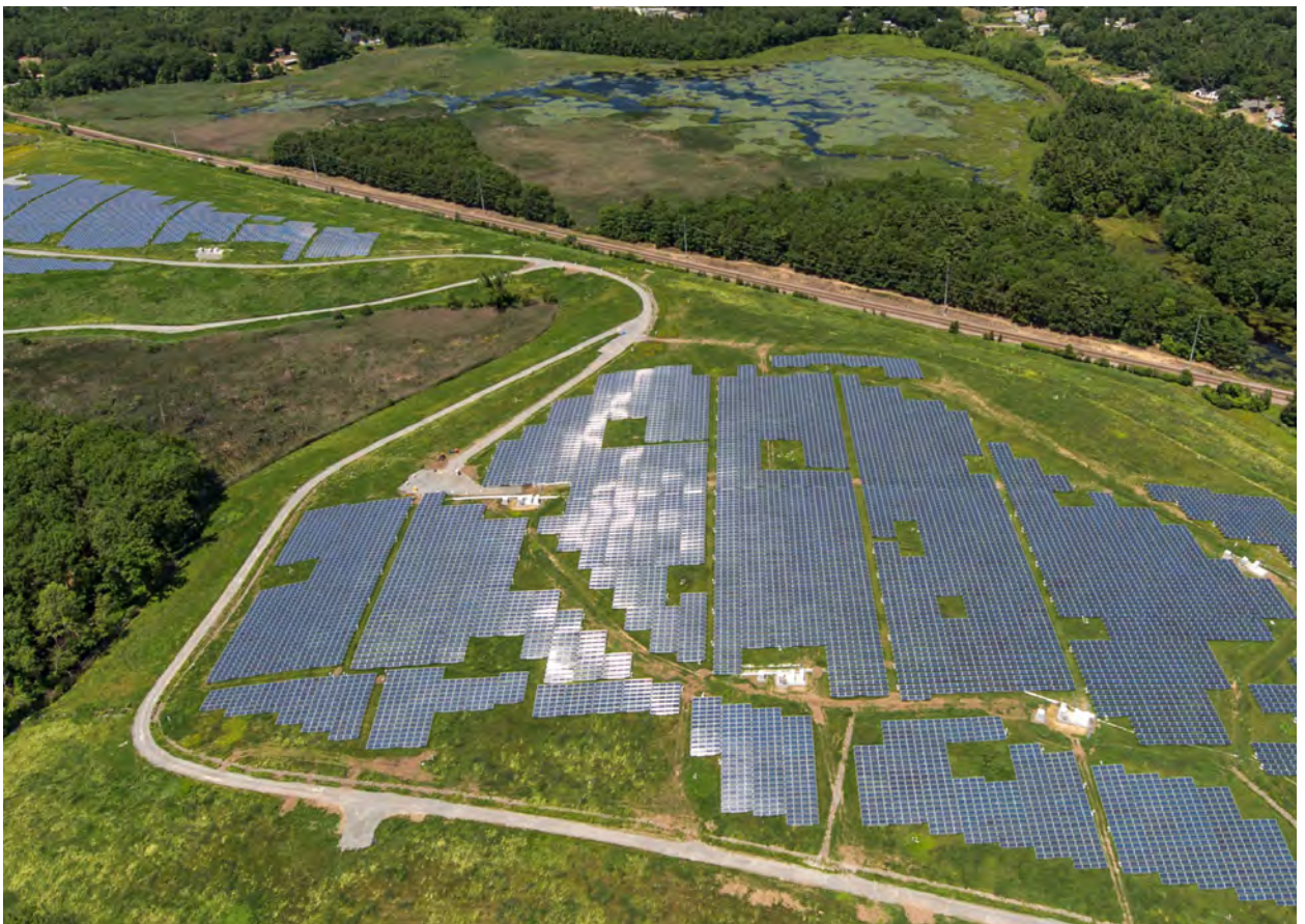
Shaffer Landfill Photovoltaic System in Pittsfield MA

More information about solar on landfills and closed sites can be found at the following link: http://www.mass.gov/eea/agencies/massdep/climate-energy/energy/landfills/