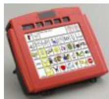
An example of an AAC device (Springboard)

This September all new teachers of students with moderate and/or severe disabilities must complete a teacher prep program that includes augmentative and alternative communication (AAC) and assistive technology (AT) in order to be licensed to teach in the state of Massachusetts.