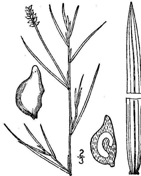
Straight-leaved Pondweed: Illustration USDA-NRCS PLANTS Database / Britton, N.L., & A. Brown. 1913. An illustrated flora of the northern United States, Canada and the British Possessions. 3 vols. Charles Scribner's Sons, New York. Vol. 1: 83

more-veined (three to five) leaves and white, coarsely fibrous stipules. Straight-leaved Pondweed is most often misidentified as the rare Fries’ Pondweed ( P. friesii ), another state-Endangered species with an affinity for alkaline waters. Straight-leaved Pondweed has flattened turions with inner and outer leaves positioned in the same plane, whereas the turions of Fries’ Pondweed are positioned at right angles to each other; further Straight-leaved Pondweed has more rigid, often bristle-tipped leaves with fewer veins than Fries’ Pondweed; the leaves of the latter species has five to seven veins with acute tips.