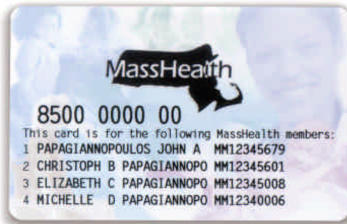
Sample of new MassHealth card (front)

This month, the Division began issuing a redesigned MassHealth card to new cardholders and to existing cardholders whose circumstances required the issuance of a new card. The Division is not replacing the MassHealth cards of cardholders whose current cards are valid. A sample of this new card appears below.