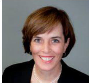
Senator Katherine Clark