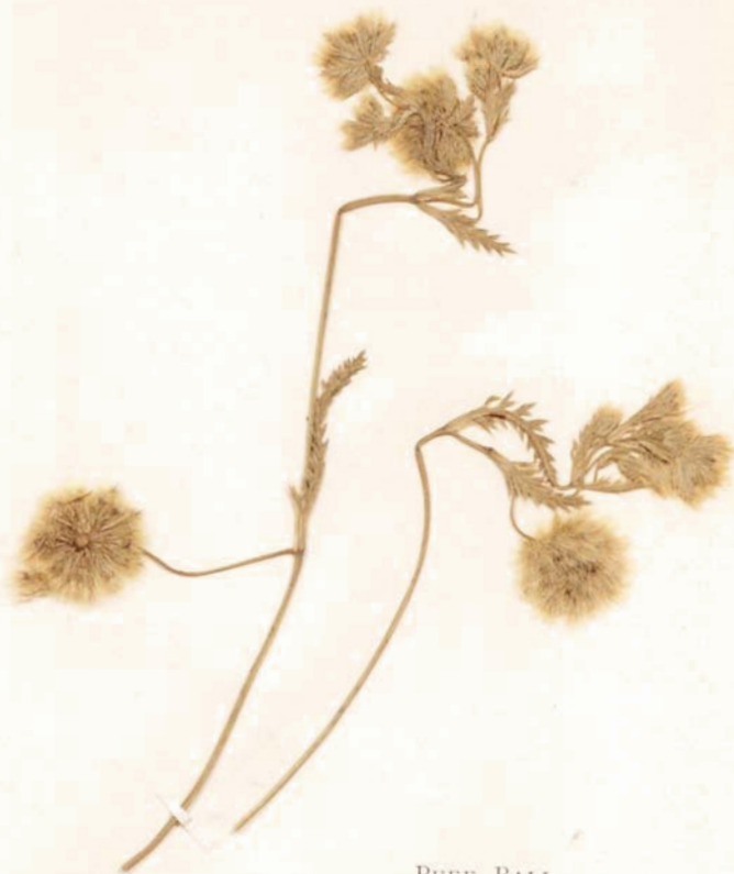
PUFF BALL Lagœcia cuminoides