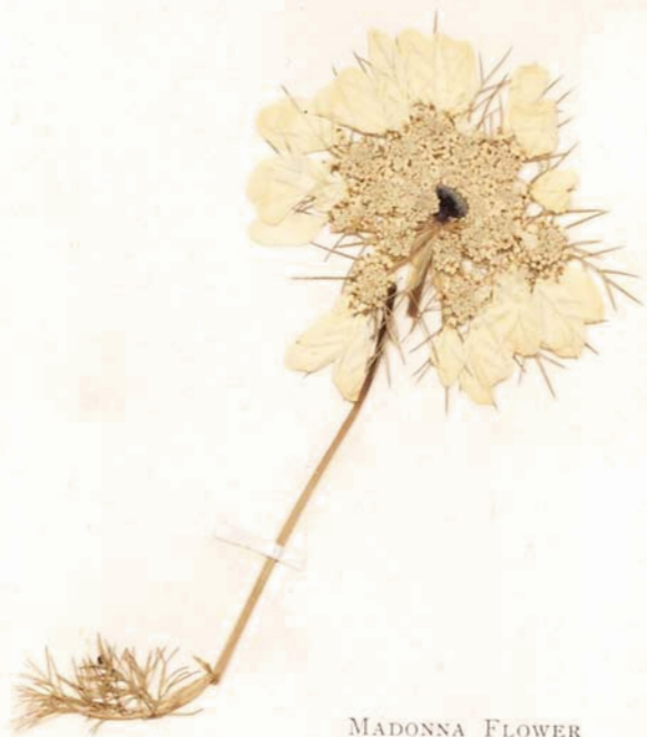
MADONNA FLOWER Artemisia squamata