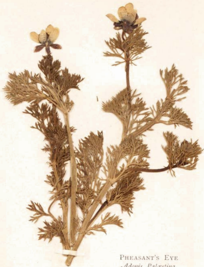
PHEASANT'S EYE Adonis Palaestina