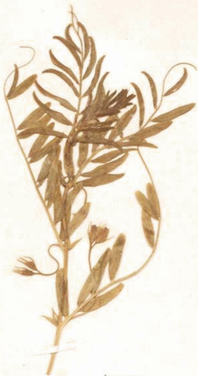
LENTIL Ercum Lens