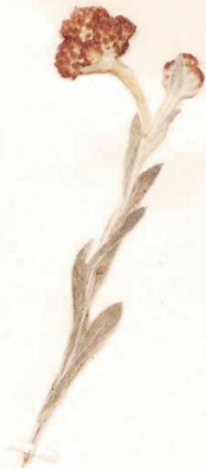
PASSION EVERLASTING Helicbrysum sanguineum