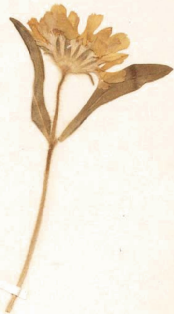
CARMEL DAISY Scabiosa prolifera