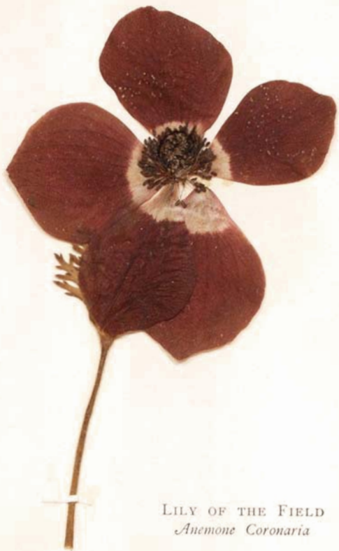
LILY OF THE FIELD Anemone Coronaria