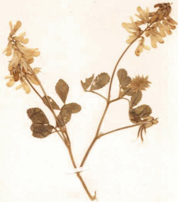
JUDEAN CLOVER Trigonella Hierosolymitana