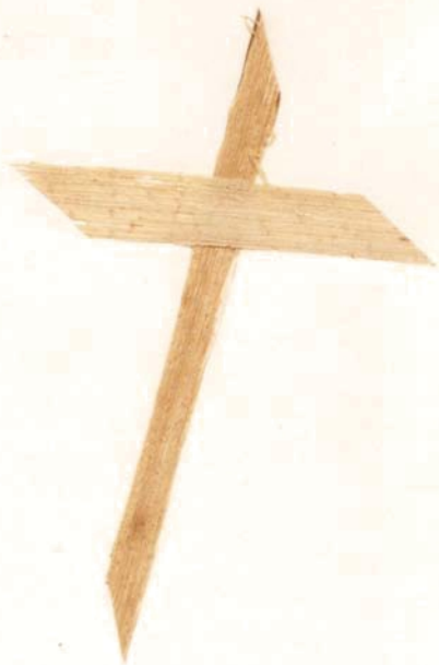
PAPYRUS Cyperus Papyrus