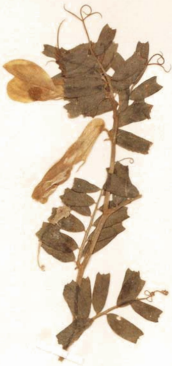
BEAN Vicia hybrida