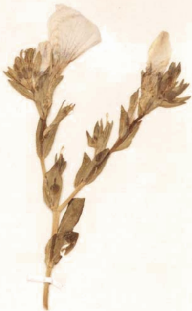
FLAX (Linen) Linum pubescens