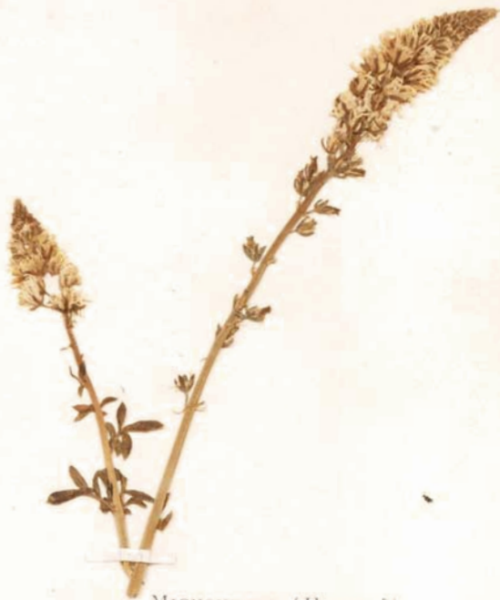
MIGNONETTE (Hyssop ?) Reseda alba