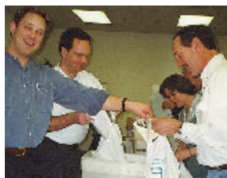
MADWEP members prepare for DWW '99.

For DWW activities, visit MADWEP's Website: www.newwa.org/madwep . ITM