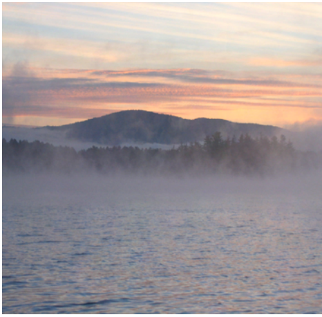
By Joe Cerutti