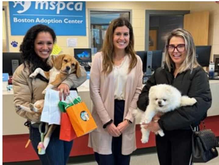
With pet owners and their recently spayed/neutered dogs