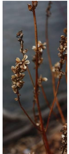
Swamp Lousewort, flowering and winter views.

SIMILAR SPECIES: There are two other species of Pedicularis that occur in New England: Wood Betony ( P. canadensis ) and Furbish's Lousewort ( P. furbishiae ). Swamp Lousewort has opposite leaves and an entire galea while Wood Betony and Furbish's Lousewort have alternate leaves and toothed galeas. Differences in habitat, phenology, and geography also distinguish these three species. Swamp Lousewort grows in wet soils and flowers late summer, whereas Wood Betony grows in dry woods or thickets and flowers in late May or June. Furbish's Lousewort only grows along the St. Johns River in Maine.