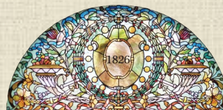
State Library of Massachusetts