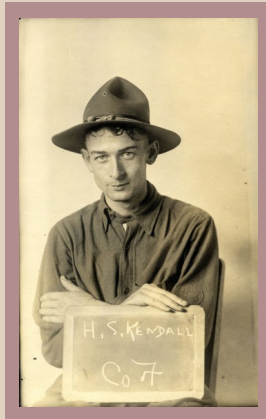
Examples from the library's photograph collections of state legislators and WWI soldiers.

Many of our resources are available online. Search our online catalog or view the library's website to learn more about these and other items in our collections: