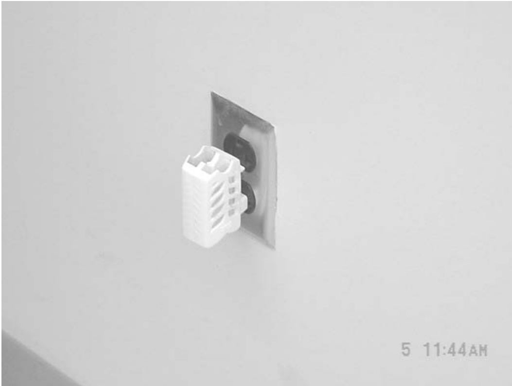
Plug-In Air Freshener in Classroom