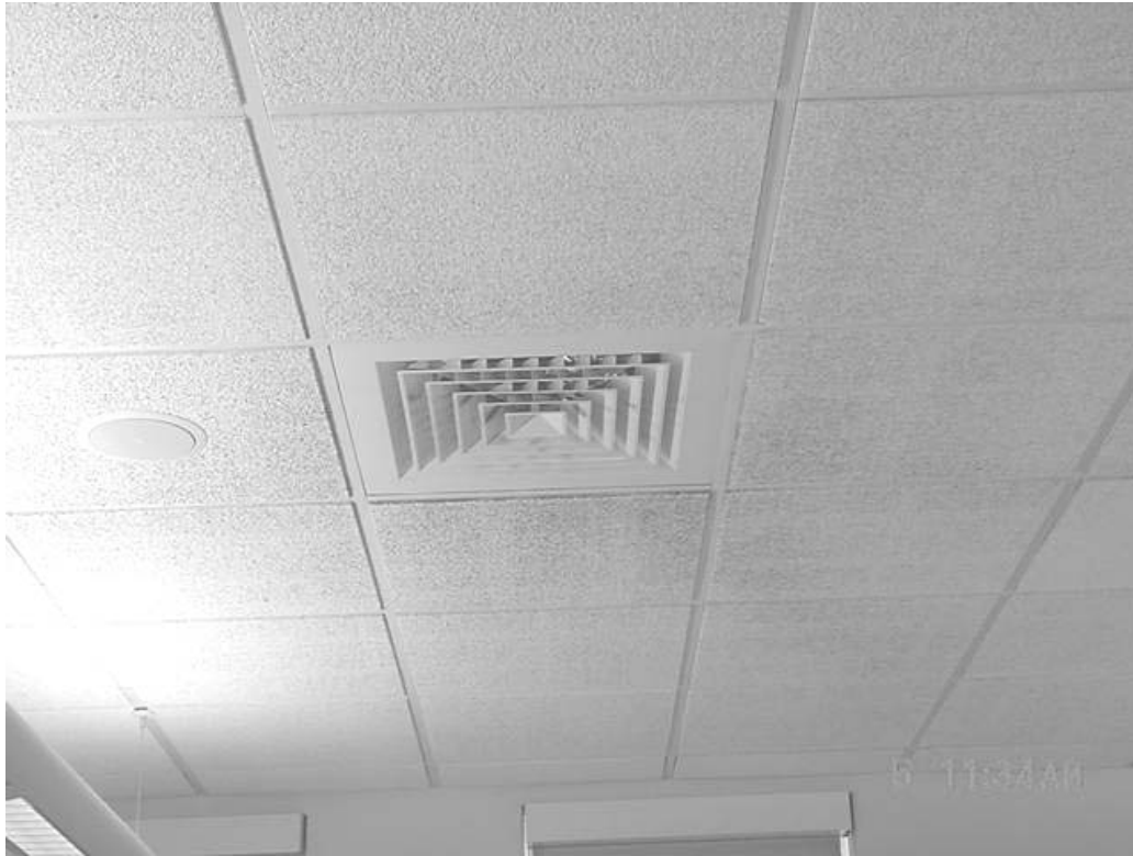
Ceiling-Mounted Air Diffuser, Note Characteristic Dust Accumulation on Surrounding Tiles