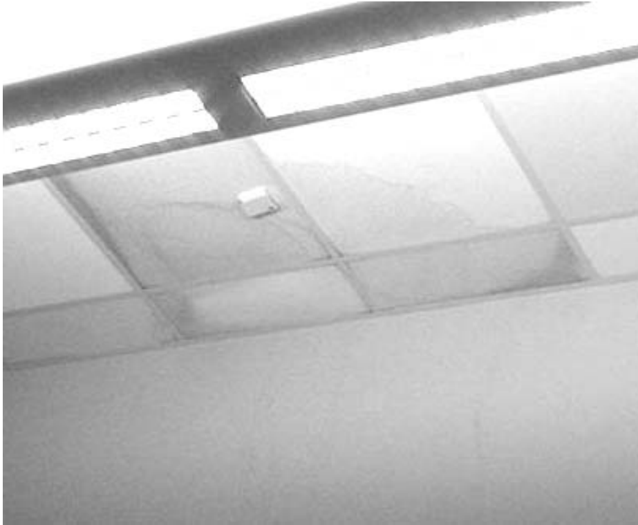
Water Damaged Ceiling Tiles