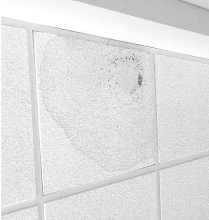
Water Damaged Ceiling Tiles, Note Dark Staining That May Indicate Mold Growth