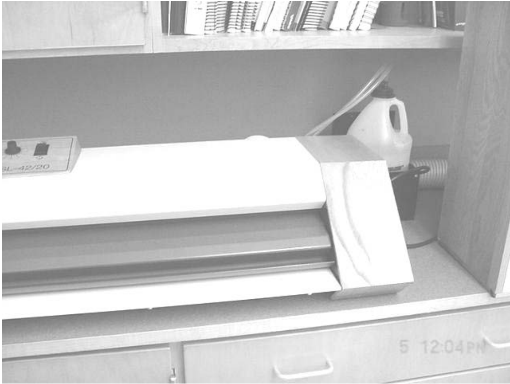
Ammonia-Based Blueprint Machine