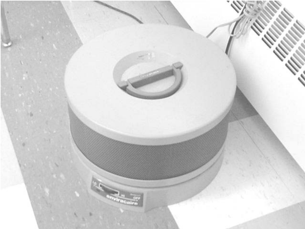
Portable Air Purifier on Floor