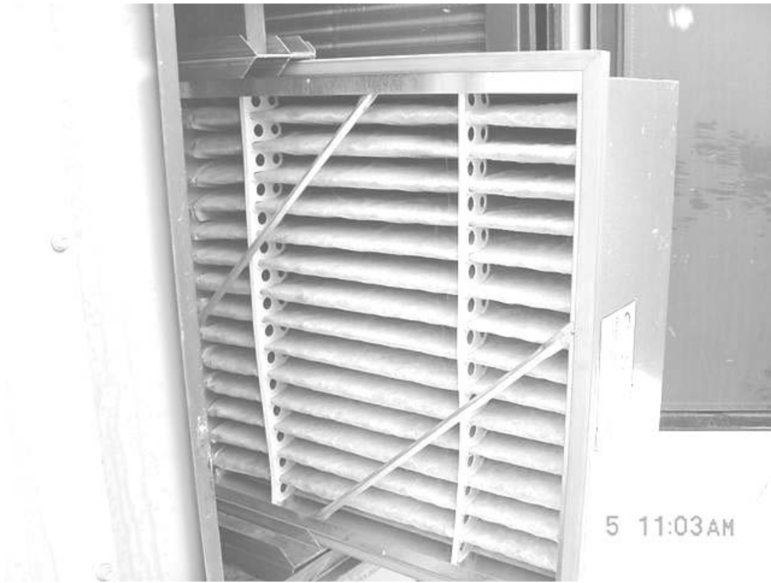
Rooftop Air Handling Unit Equipped With Secondary Bag Filters