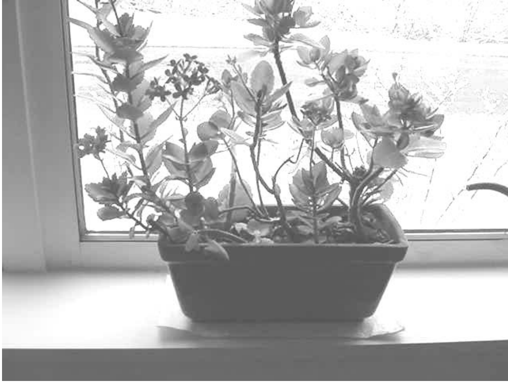
Classroom Plant on Paper Towel