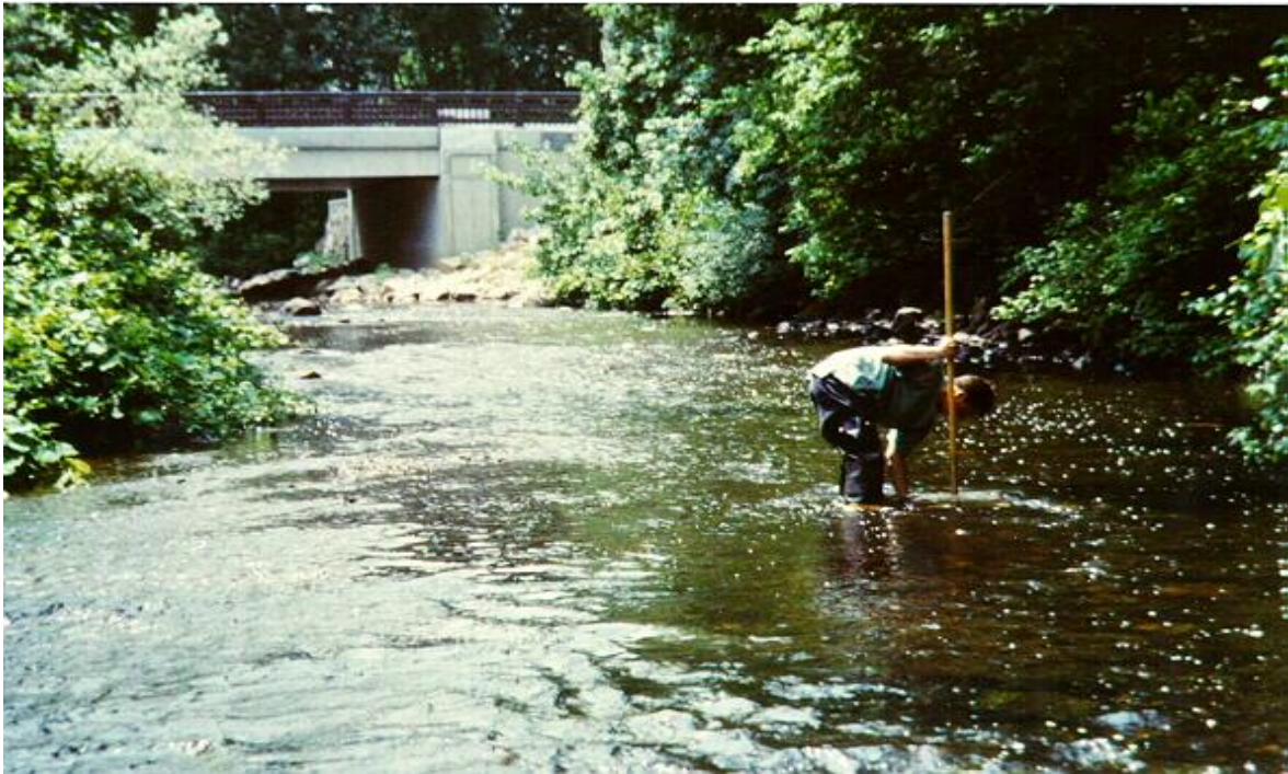
Figure 1. MassDEP/DWM biologist collecting macroinvertebrates using the “kick-sampling” technique.