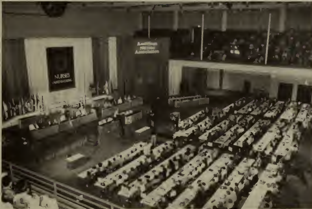
The 4,032-seat Hynes Veterans Memorial Auditorium is filled to capacity by the American Nurses Association.

This year's Boston convention featured speakers, panels and educational sessions that dealt with the many facets of working as a nursing professional. Keynote