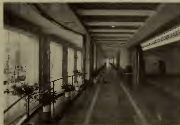
Tour the Hynes via video. Call 617-954-2300 for a copy.

"I'm pleased to announce that our first video, featuring the award-winning Hynes Veterans Memorial Convention