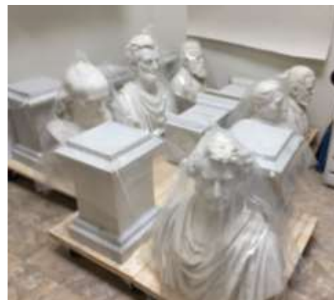
Above: Details of busts of Henry Wilson and Charles Sumner await treatment. Lower: Bust of George Boutwell, before and after cleaning and repair; treated busts and pedestals await return to the State House.