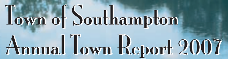
View from College Highway Bridge Looking Out on the Manhan River & Sheldon's Ice Cream