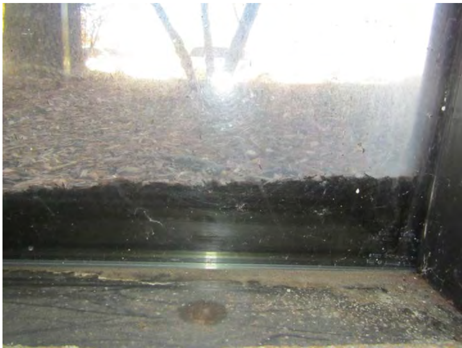
Bark mulch piled high above the level of window/frame