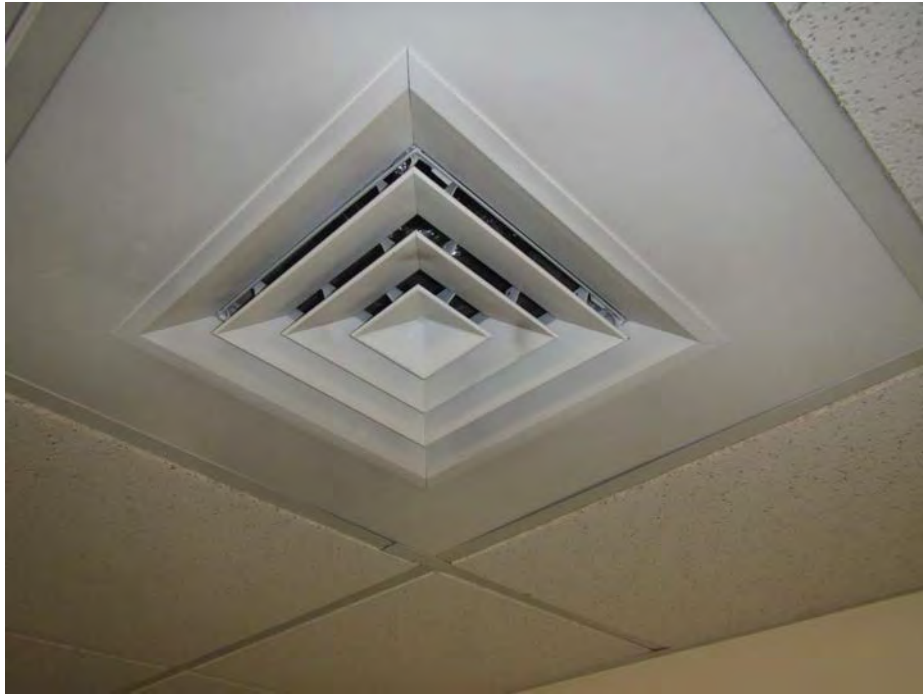
Supply air diffuser