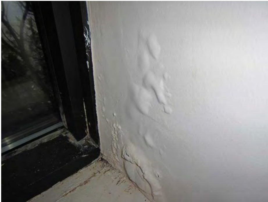
Water-damaged wall and window sill