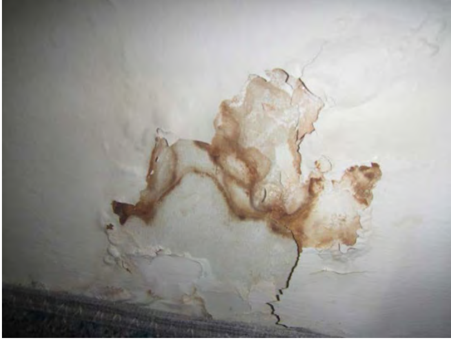
Water-damaged wall and carpeting