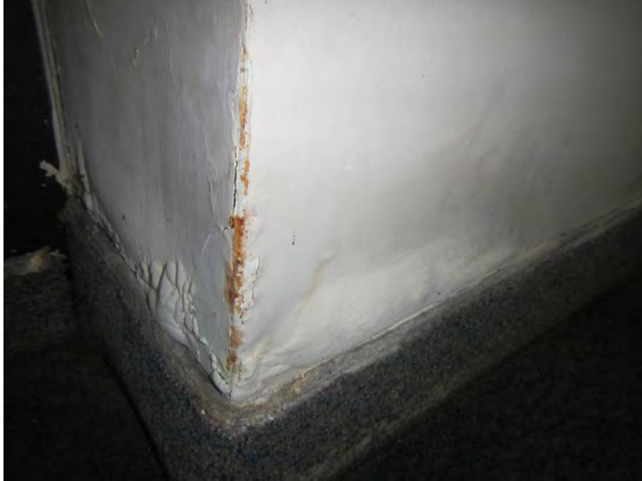
Water-damaged gypsum wallboard and carpeting