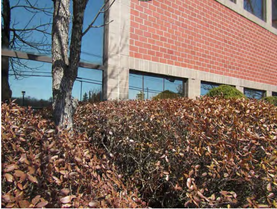
Trees and vegetation growing against building exterior