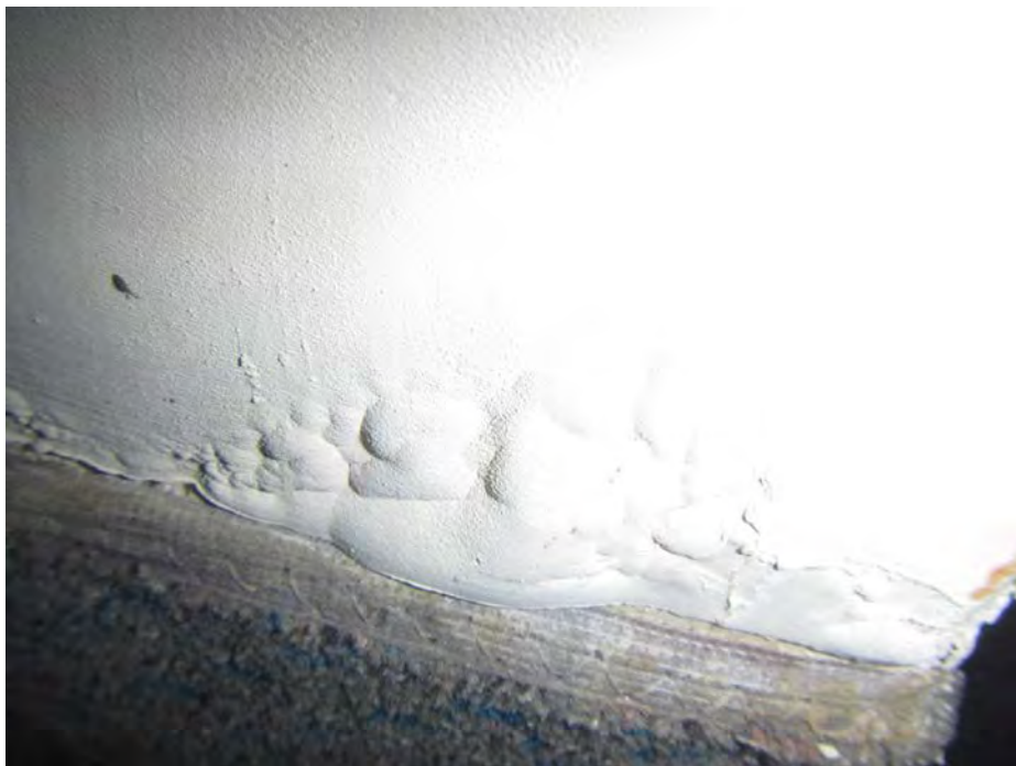
Water-damaged wall and carpeting