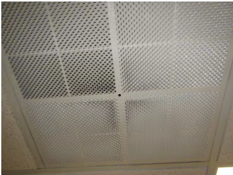
Ceiling-mounted return vent